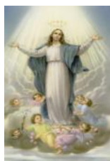
Assumption of the Blessed Virgin Mary Thursday, August 15 th – Holy Day of Obligation Masses at 6:30AM, 8:30AM, 12:05PM & 7PM

Most Reverend Charles J. Chaput, OFM Cap